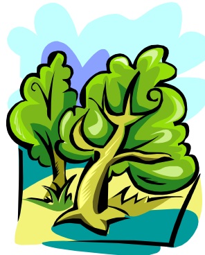
FIND SOME SHADE

The City has provided the Art Center, at no cost, recycling bins. We appreciate their support in this effort!